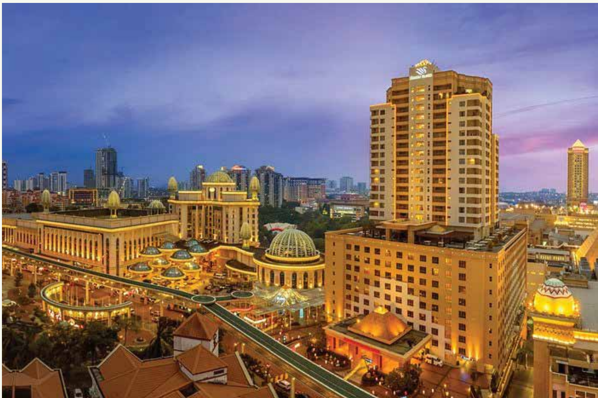
Sunway Pyramid Hotel | Sunway Group Contract Sum : Rm 900k