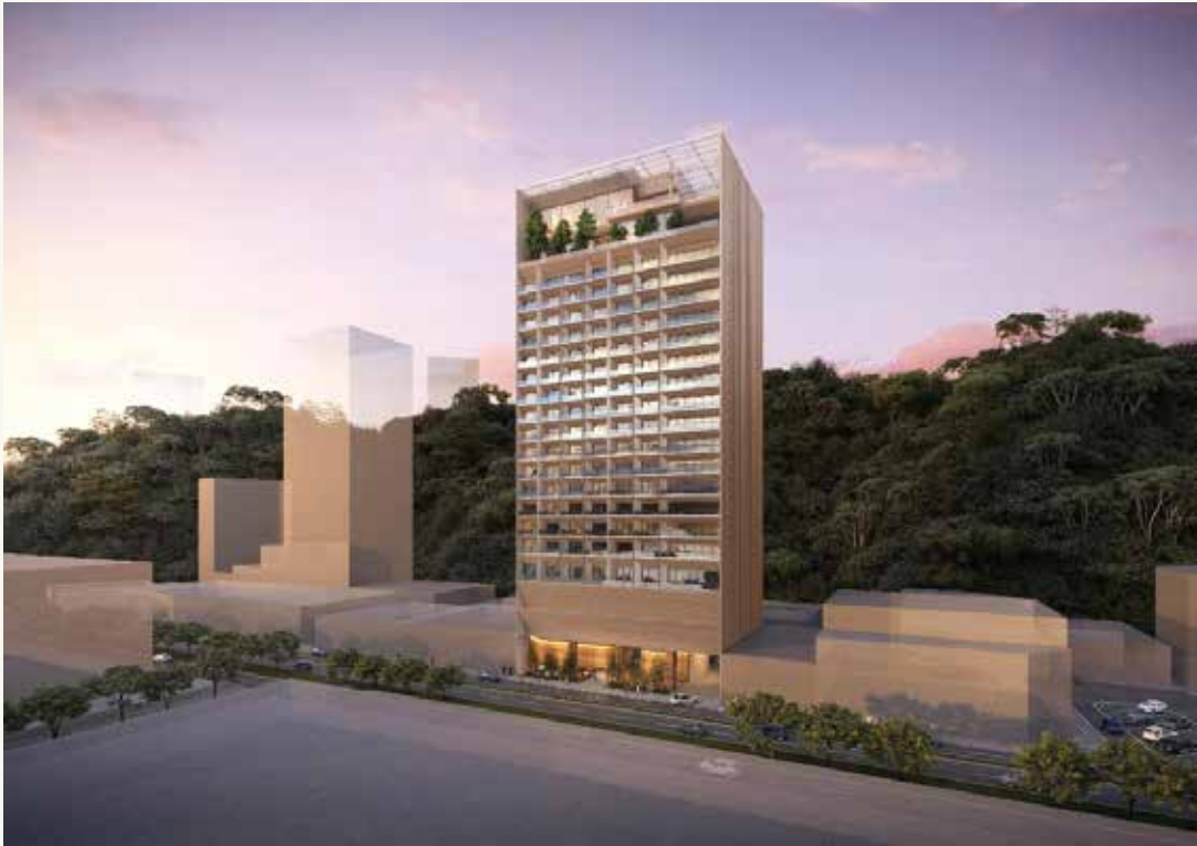
Hyatt Centric Hotel Kota Kinabalu Hap Seng Consolidated Berhad Contract Sum : Rm 600k