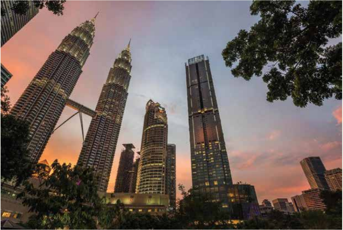
Four Seasons Hotel Venus Asset Sdn. Bhd Contract Sum : Rm 300k