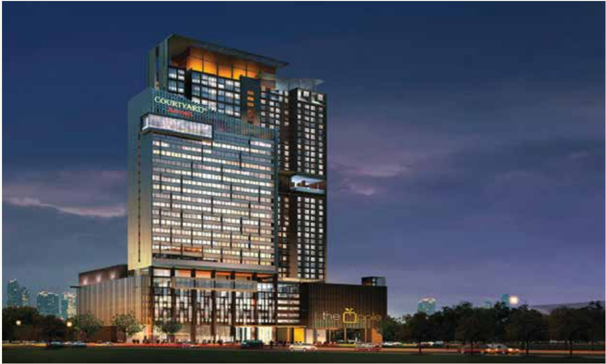
The Apple @ Melaka | Apple 99 Development Sdn Bhd Contract Sum : Rm 800k