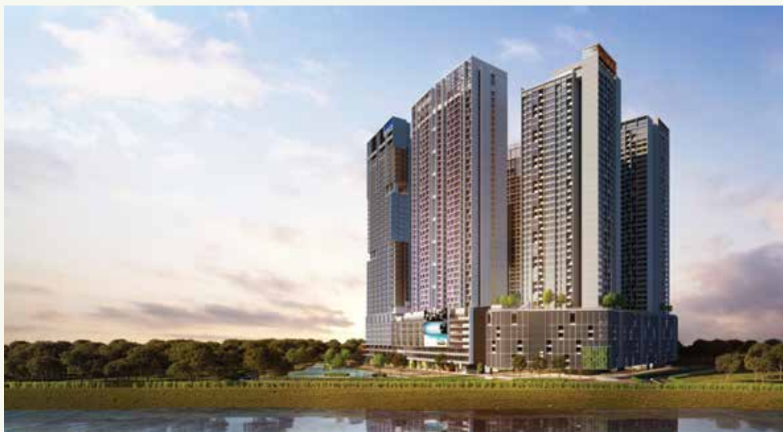
Millerz Square @ Old Klang Road | EXSIM Contract Sum : Rm 500k