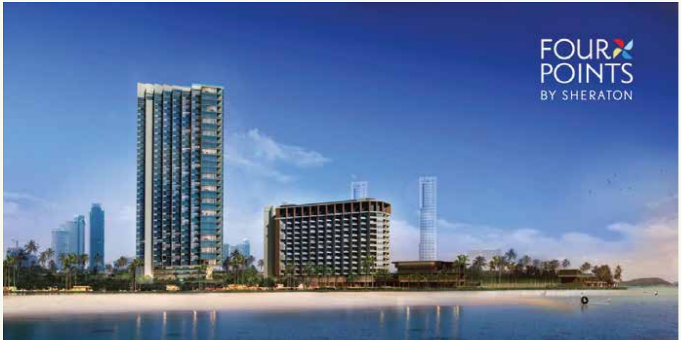
Four Points Ireka Development Management Sdn Bhd Contract Sum : Rm 300k