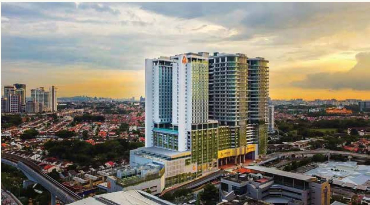
Avante Hotel See Hoy Chan Holdings Group Contract Sum : Rm 1il