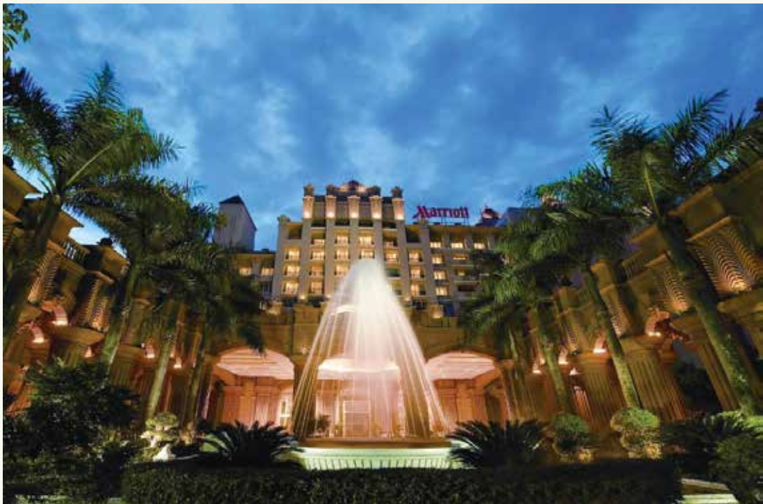
Marriott Hotel Putrajaya IOI Properties Group Contract Sum : Rm 900k