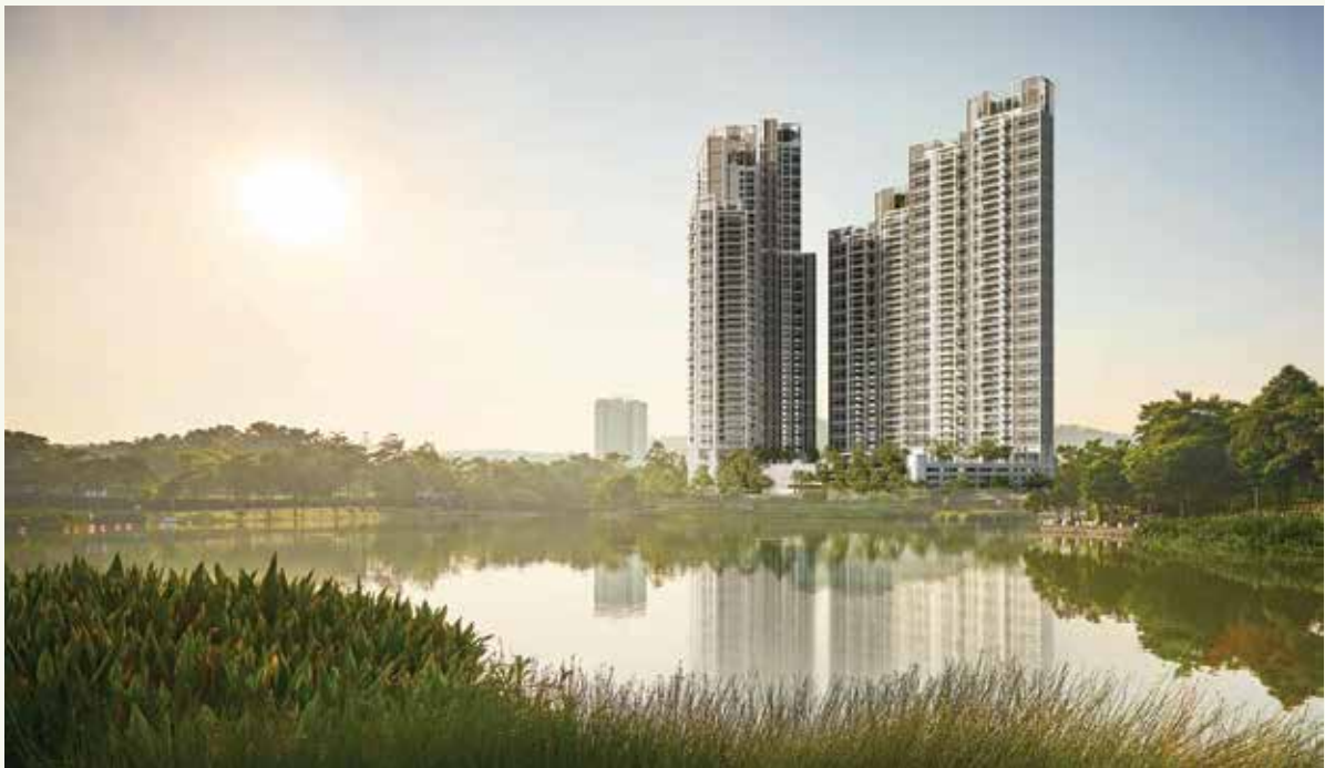
Park Regent @ Desa ParkCity Cloudvest Sdn Bhd Contract Sum : Rm 500k